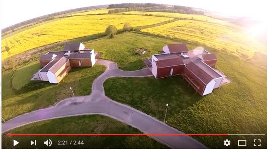
Sinimäe village ( Sinimäe alevik )